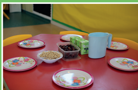
This is our cloakroom where you will hang your coat and bag and there is a snack table for the children to enjoy a selection of snacks.