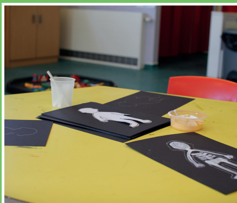
These photos above are of the Nursery areas