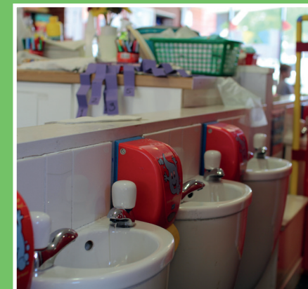
There are toilets within the Nursery.