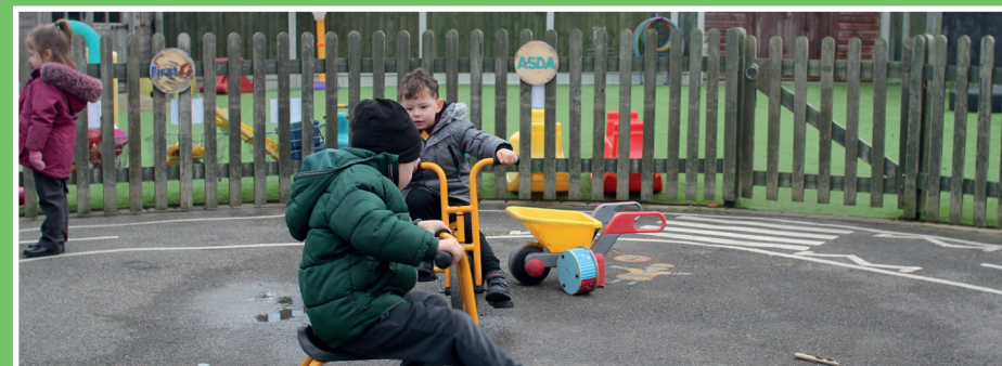
We have a lovely outdoor area with climbing frames, bikes and a stage area. Below are photos of our dining hall where we have lunch.